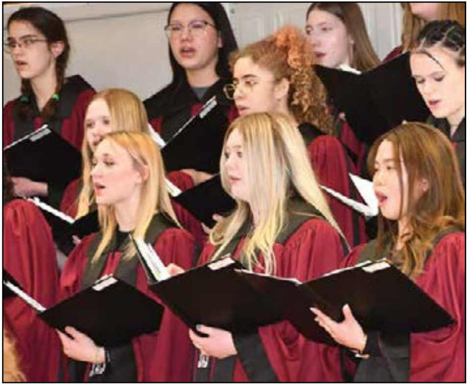
Members of the Sidney High School choir sing one of their numbers during the concert last week.