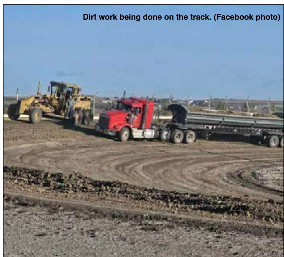
Dirt work being done on the track.

to share the results of their efforts with all that come to enjoy the races! Troy will also be introducing a new feature to the Speedway shows to involve the spectators and community. He has built a two-seater modified car, and at each race, tickets will be sold, and the raffle winner will get to ride with a driver in the car. The proceeds of these sales will be split 50/50; half to the track and half to a different charity each week. Prizes will see a change as well, with large 2 ft. x 6 ft. printed checks replacing trophies. While not everyone has a trophy case, they all have a garage or shop where they work on their car and the checks are a great way to commemorate a win. Smaller decorative checks will be gifted to youths picked from the crowd to celebrate with winners as "Trophy Buddies", a tradition that will continue at the Speedway. There was a practice run on May 4 and May 11 will be their Season Opener. Every other Saturday