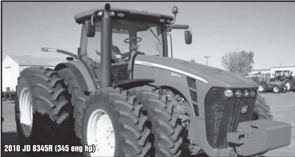
2010 JD 8345R (345 eng hp)