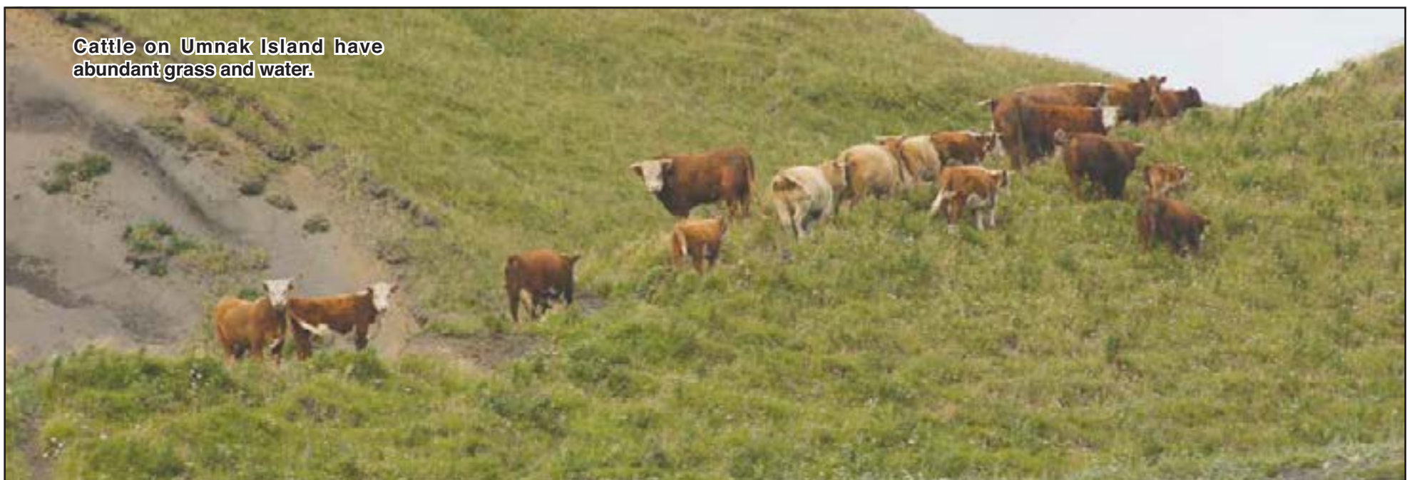
Cattle on Umnak Island have abundant grass and water.

A trip of a life time to a place that very few people in the world know about, or have seen since World War II, may be repeated as both men plan to return, maybe as soon as next year, for more adventures, and to pursue opportunities with the quality animals on Umnak Island. More pictures can be viewed at ramburchar.com