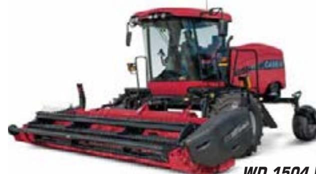
CASE IH WD 1504 WINDROWER