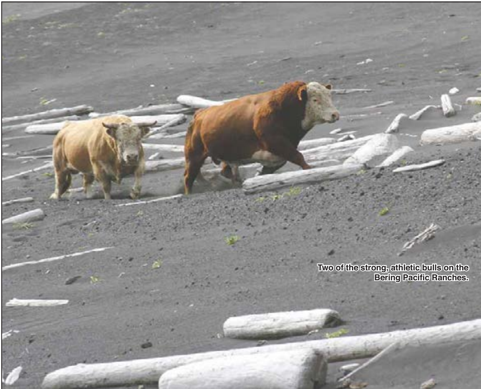
Two of the strong, athletic bulls on the Bering Pacific Ranches.