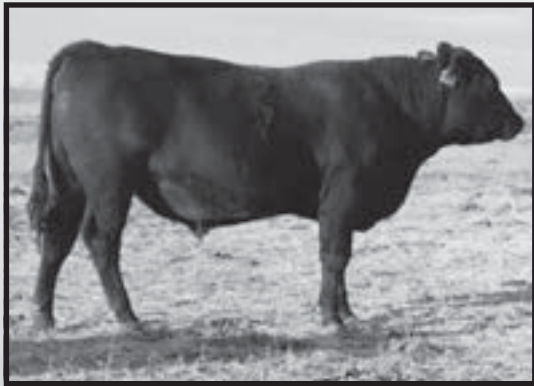
He Sells! FCC Medicine Man 4106