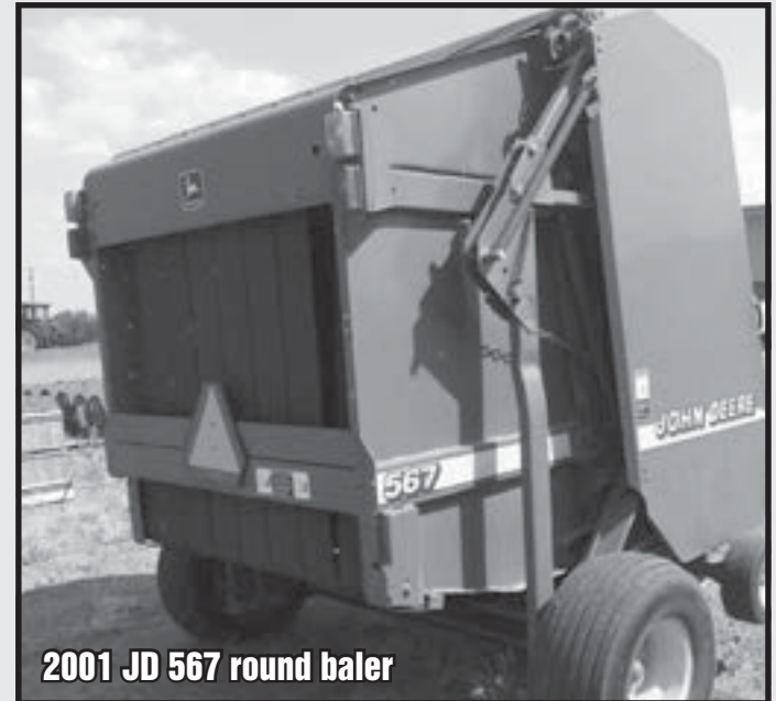
2001 JD 567 round baler