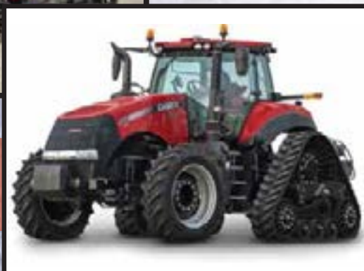
380 MAGNUM ROWTRAC