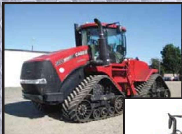
500 STEIGER QUADTRAC