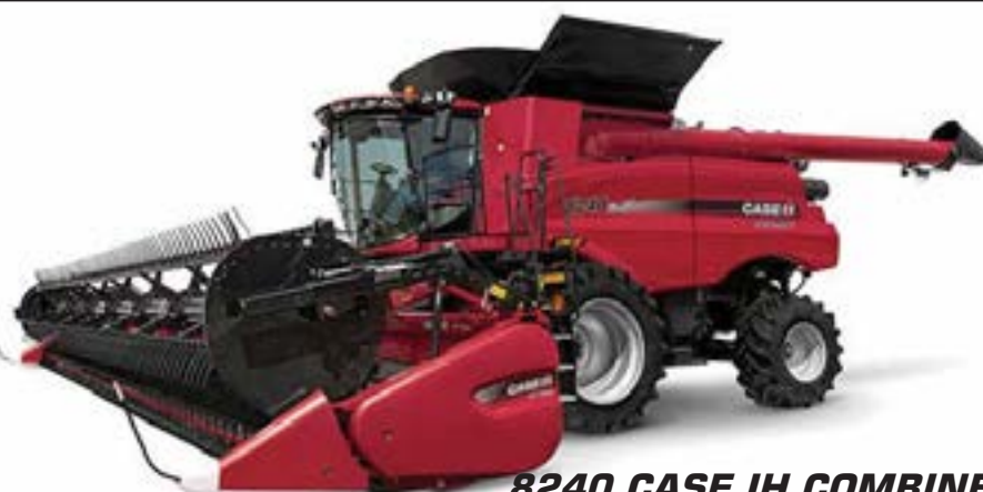
8240 CASE IH COMBINE

Case IH Precision Air 100 Pull-Type Sprayer Case IH 530C Disc Ripper