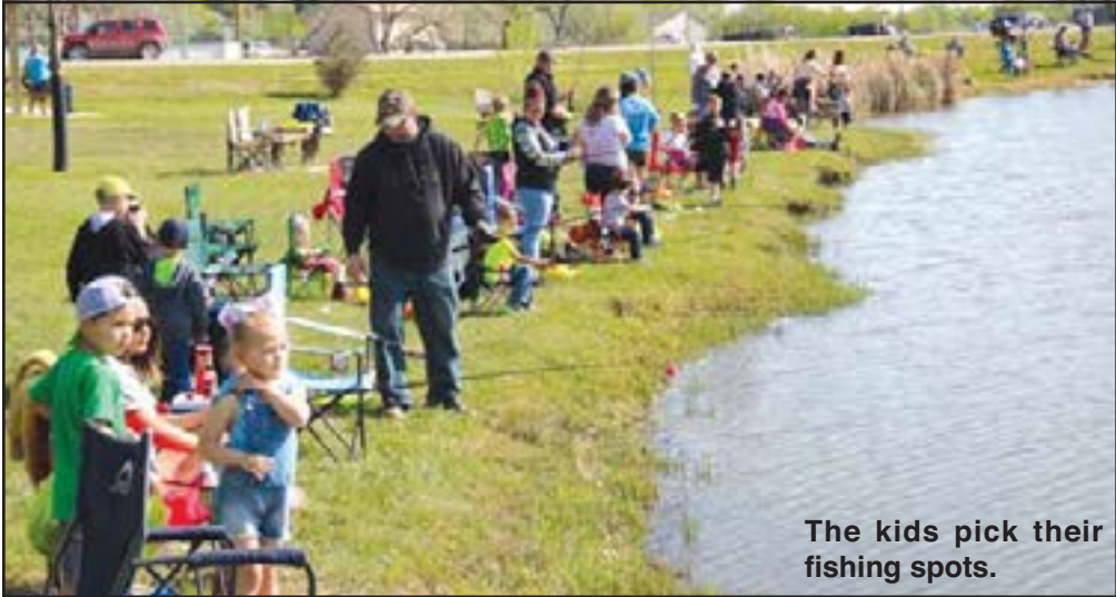
The kids pick their fishing spots.