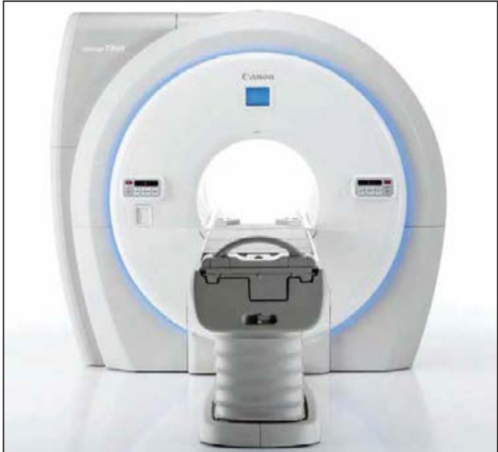
The Vantage Titan™ MR system is 18 percent larger, allowing for a more comfortable experience for patients.

Canon Medical Systems USA, Inc., headquartered in Tustin, California, markets, sells, distributes and services