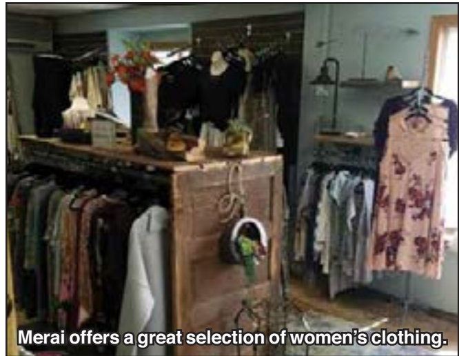
Merai offers a great selection of women's clothing.

tops, pants, workout gear, shoes and jewelry. Sizes are small through 3X. Prices range from $20-$65. Jeans cost between $45-$90.