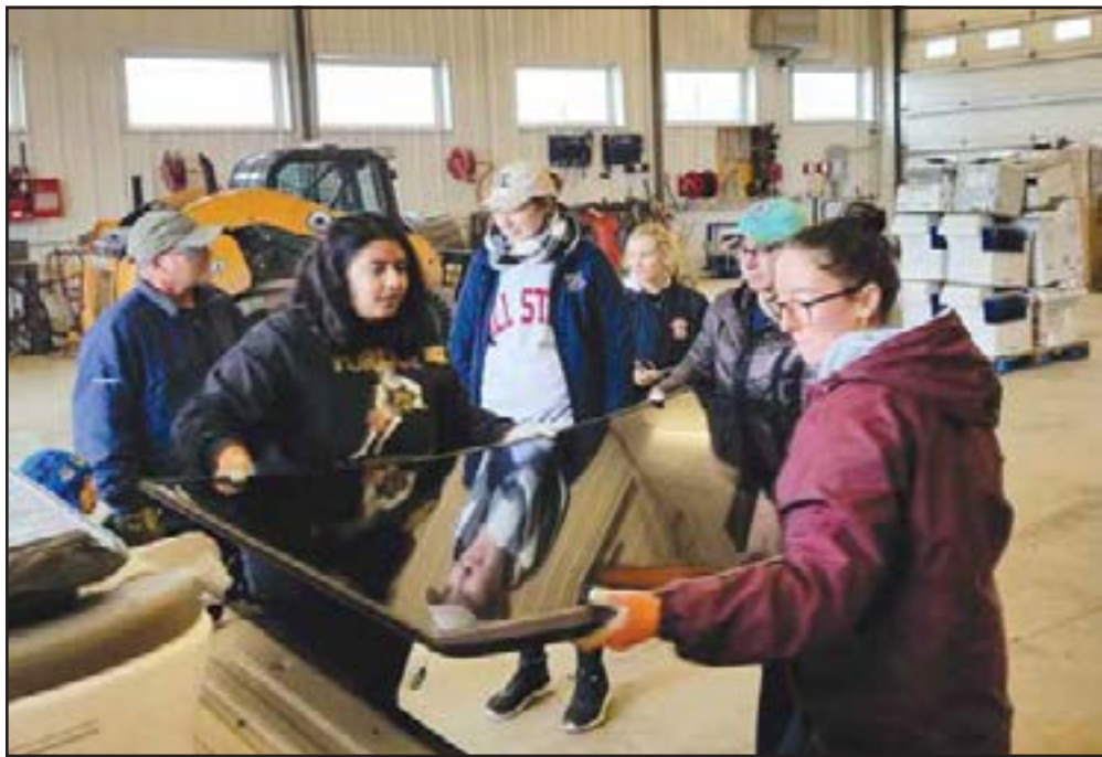
Ameri-Corps volunteers haul a TV with a cracked screen that was brought to the E-Waste event.

The organizers also want to extend a hearty thank you