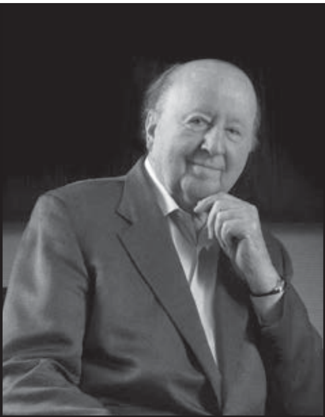
George Mitchell, "the Father of Shale."

adopted Mitchell's Techniques to oil fields, crude production has more than quadrupled in the Bakken formation in North Dakota and Montana in the past three years and U.S. gas production rose 25 percent in the past decade, pushing prices to a 10-year low in April