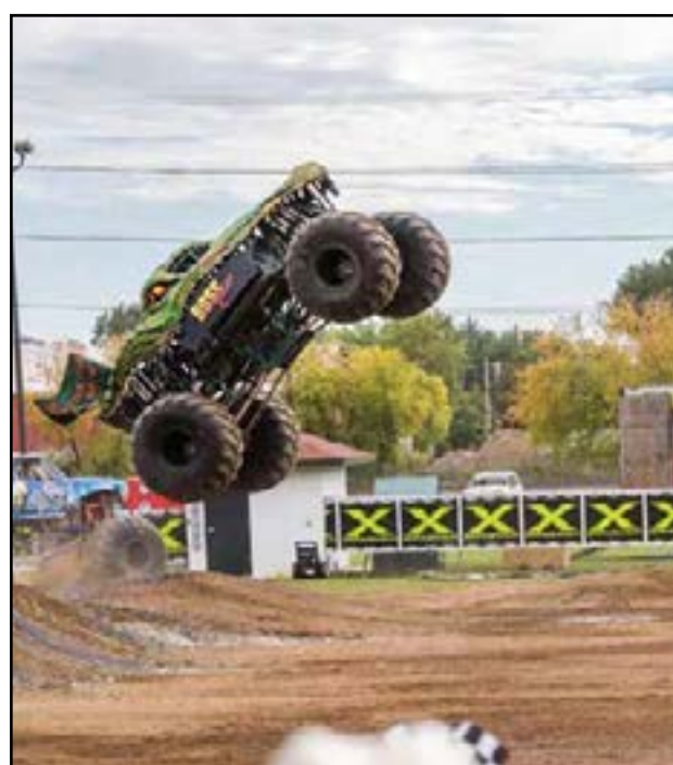
Boss Gator

Go to richlandcounty-fairandrodeo.com to purchase your tickets and enjoy an adrenaline-packed Memorial Day Saturday at the fairgrounds.