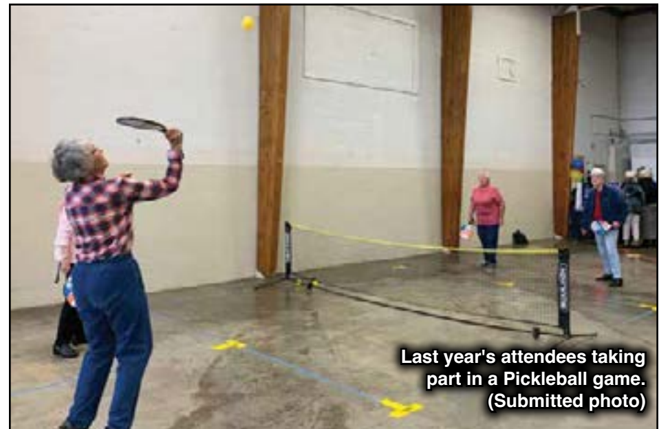
Last year's attendees taking part in a Pickleball game. (Submitted photo)

2. Information to keep you connected year-round. Come and learn about opportunities to put