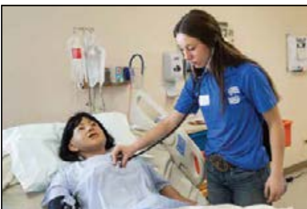
Students from Sidney, Savage, Fairview, Richey and Grenora participated in a day of hands-on learning at Sidney Health Center. (Submitted photo)