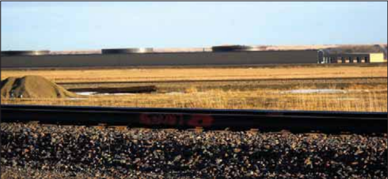
A large multi-user rail terminal in Trenton, ND, which began construction early 2011, is noticeably progressing. The Bakken Petroleum Hub can easily be seen at Marley Crossing near Trenton on Highway 1804.

The Bakken Petroleum Hub will be managed by Savage's Railway & Industry Solutions Group, which oversees more than 50 specialty rail services and transloading terminals throughout the U.S.