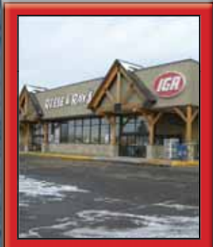
Reese & Ray's IGA