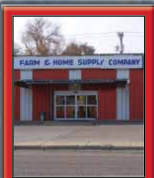
Farm & Home