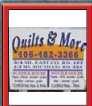
Quilts & More