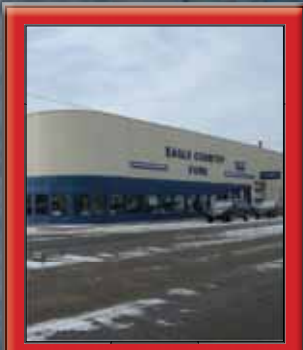
Eagle Country Ford