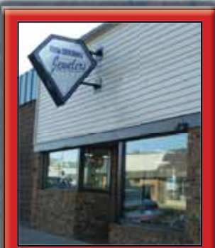
John Stockhill Jewelers