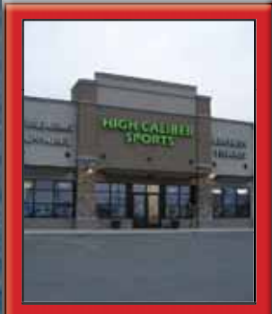
High Callber Sports & C4 Athletics