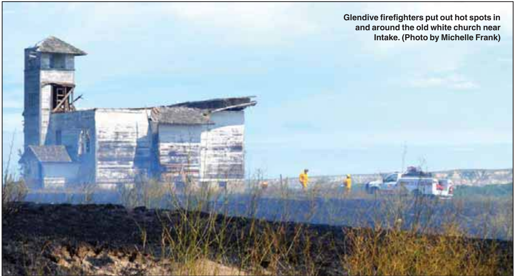
Glendive firefighters put out hot spots in and around the old white church near Intake.

Nearly 80 acres of coulee and grassland burned, as