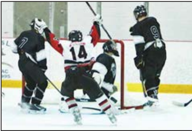
Watford City Oilers celebrate after scoring against the Langdon Blades on Saturday on their home ice. The Oilers recorded two wins over the weekend against Langdon and Grand Forks.