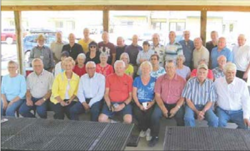
The Sidney High School 1960 graduating class at their 55th High School Reunion in 2015.