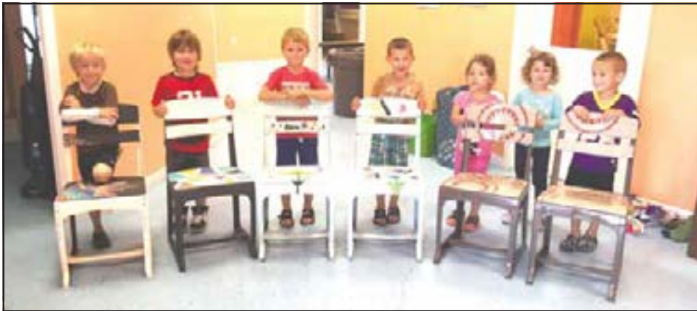
Jitterbug Preschool joined the fun by decorating these six chairs.

There are only 25 Early Bird tickets available. They are $40 and include early admittance at 5:00pm, a handcrafted pottery bowl or mug, and the opportunity to bid on the two mystery chairs to be unveiled that evening.