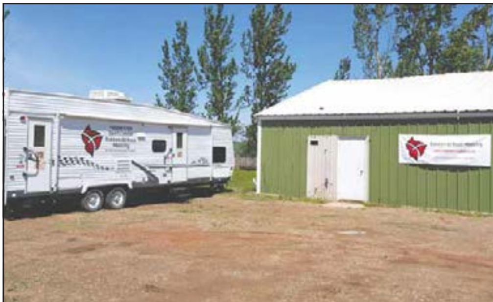
Below: The traveling thrift store is open first and third Tuesdays of each month.