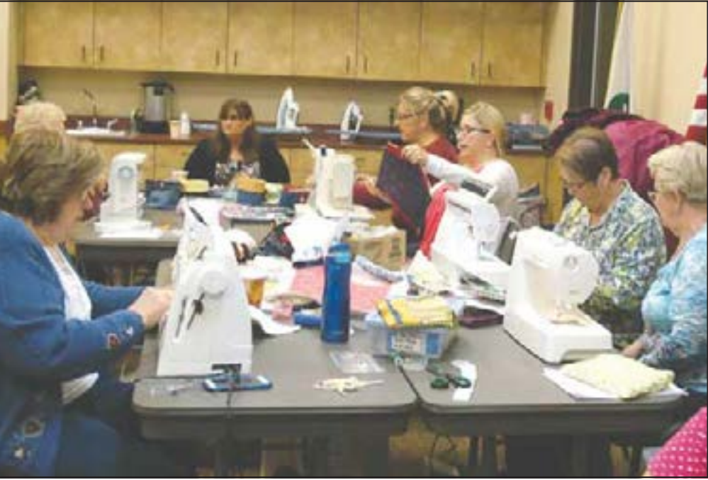
Above: The 2015 Sip & Sew welcomed people of all ages and sewing levels.

The Sidney Chapter currently has about 35 members, but are always ready to welcome newcomers, especially younger generations, in hopes that the art and skill of sewing will be carried on.