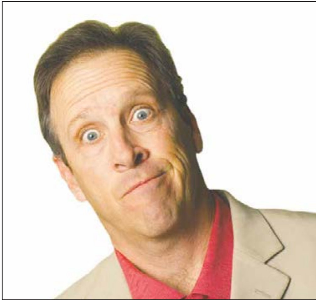
Comedian Jeff Allen gives a family-friendly performance that will have the audience in stitches.