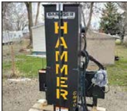
DANUSER HAMMER POST POUNDER