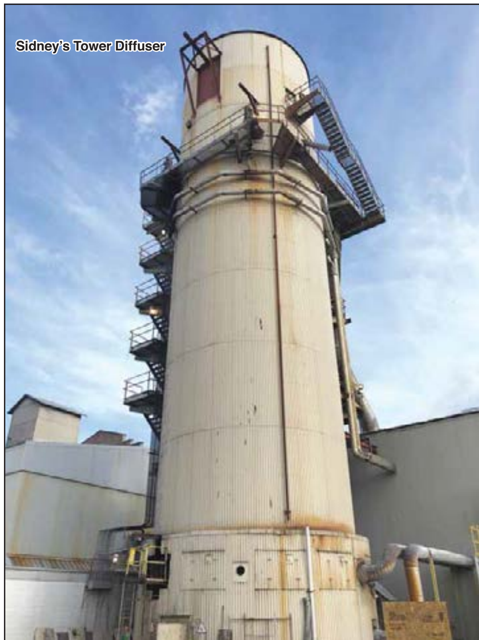
Sidney's Tower Diffuser