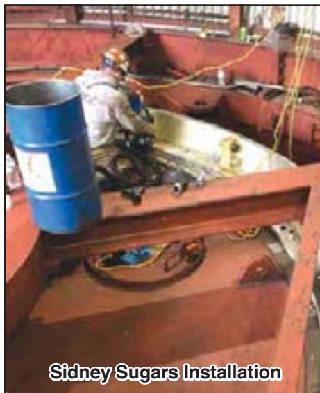
Sidney Sugars Installation