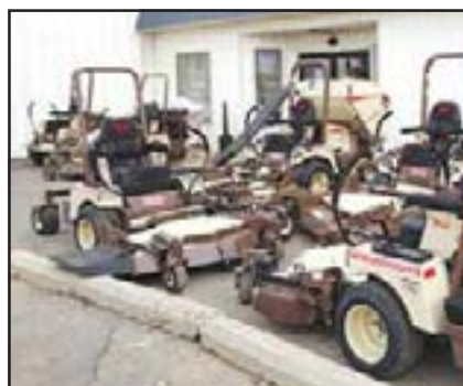
NEW GRASSHOPPER MOWERS IN STOCK!

Phoenix Rotary Harrow 60', very nice condition, consigned... $20,000