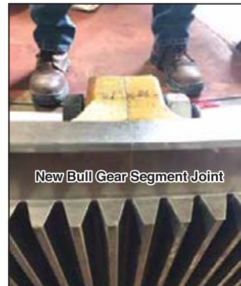
New Bull Gear Segment Joint