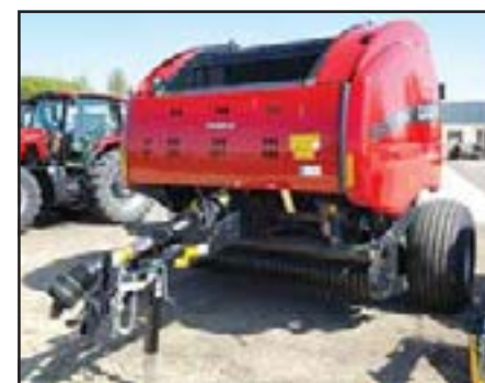
CASE IH RB565 ROUND BALER