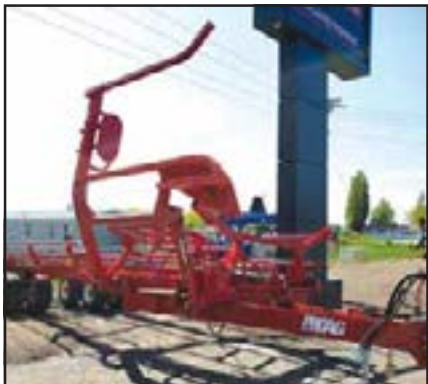
PROAG 4400 BALE CARRIER