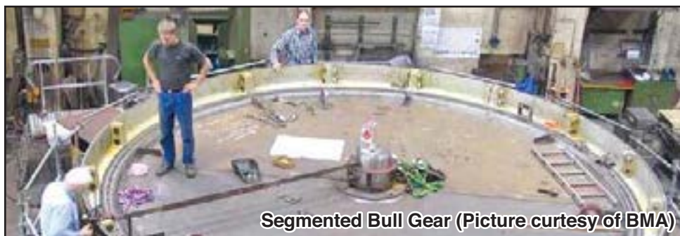
Segmented Bull Gear

Extraction Process: One of the first steps in processing Sugar Beets is extracting the sugar from the beet cells which takes place in the Tower Diffuser. Sugar Beets are washed and then sliced into Cossettes which resemble a Ruffles potato chip. The cossettes are then scaled in the Cossette Mixer prior to being pumped into the bottom of the Tower Diffuser. Inside the Tower, extraction of the sugar molecule from the beet cells takes place as rotating flights move the densely packed cossettes from bottom to top of the tower. Fresh and Press water are introduced at the top of the tower and flow countercurrent to the cossettes, extracting the sugar. Roughly 98% of the sugar in the beet is removed from the cossettes (pulp) by the time it exits the top of the tower. The sugar juice exiting the bottom of the tower is called Raw Juice which goes on to Purification steps and eventually Crystallization.